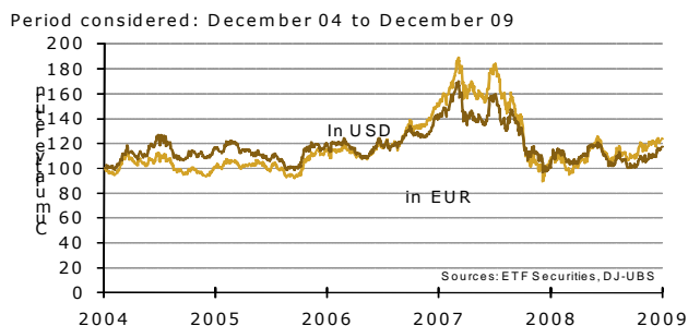
DJ-UBS Agriculture Total Return Historical

* the index performance shown here is a Total Return Index. Back-tested historical performance exists back to 1991 however the Sub-Index shown was first published by DJ-UBS in April 2006. Please refer to the Historical Performance Disclaimer on the following page.